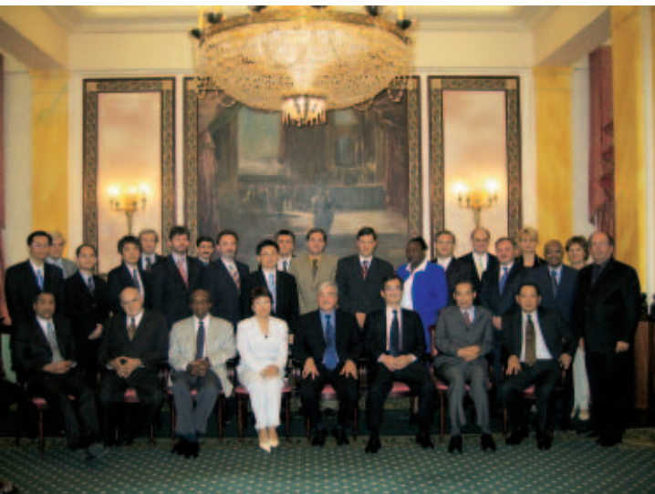
EXECUTIVE COUNCIL MEETING, PARIS, AUGUST 2004